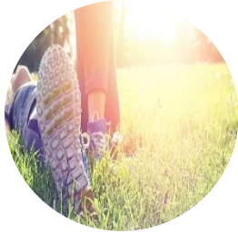
KBC's Environmental Footprint