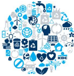
KBC Sustainability Policies